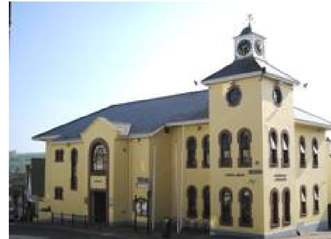
Central Library, Letterkenny.

A guide to exploring your Local and Family history with Donegal Libraries.